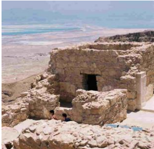
Fortress at Masada